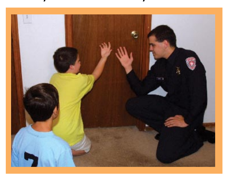
Figure 3: Feel the door with the back of your hand.

(see Figure 3). If it is hot, do not open it. Use your second way out.