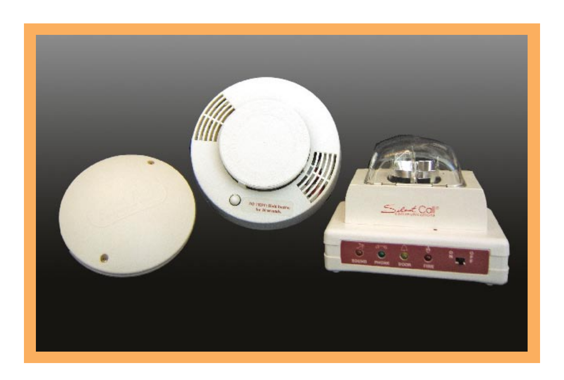
Figure 1: A smoke alarm for people who are hard of hearing.

You need at least one smoke alarm outside every sleeping area and on every level of your home. The most dangerous fires occur when you are sleeping. The smoke alarm should detect the smoke before it reaches your sleeping area and wake you up.