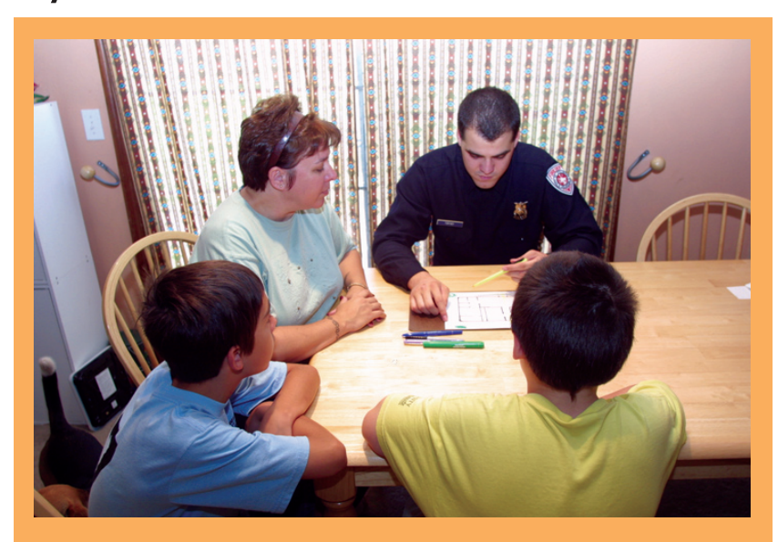
Figure 2: A family makes a home escape plan.

A home escape plan is your way out of your home if you have a fire. After you plan your escape, all family members should practice the escape plan every six months. The more you practice your escape plan, the more prepared you will be to take action in an emergency.