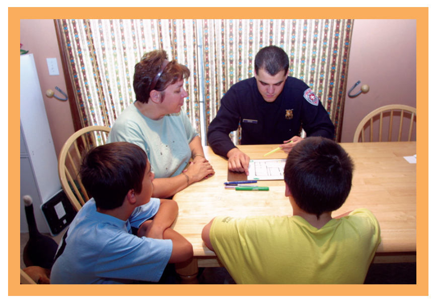
Figure 2: A family makes a home escape plan.

A home escape plan is your way out of your home if you have a fire. After you plan your escape, all family members should practice the escape plan every six months. The more you practice your escape plan, the more prepared you will be to take action in an emergency.