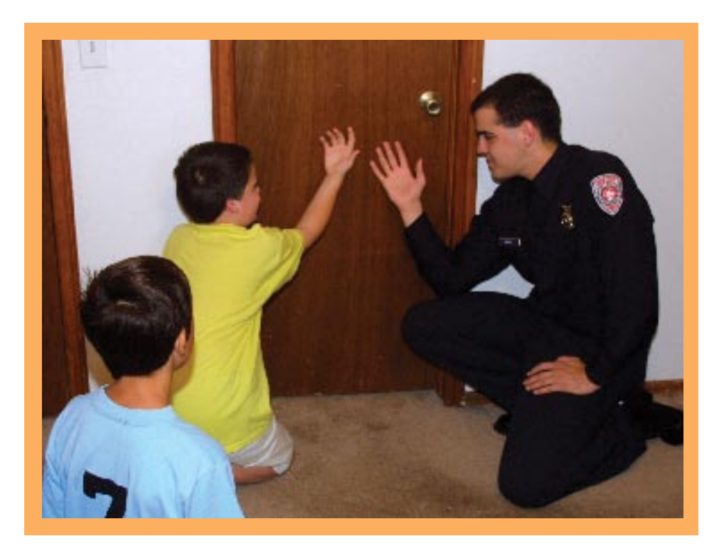
Figure 3: Feel the door with the back of your hand.

If the door does not feel hot, open it with caution. There still may be smoke and heat on the other side. If you open the door and find smoke or heat, close the door, and use your second way out. If the path to the outside is clear of smoke, or if you can crawl under the smoke, move quickly to the exit (see Figure 4).