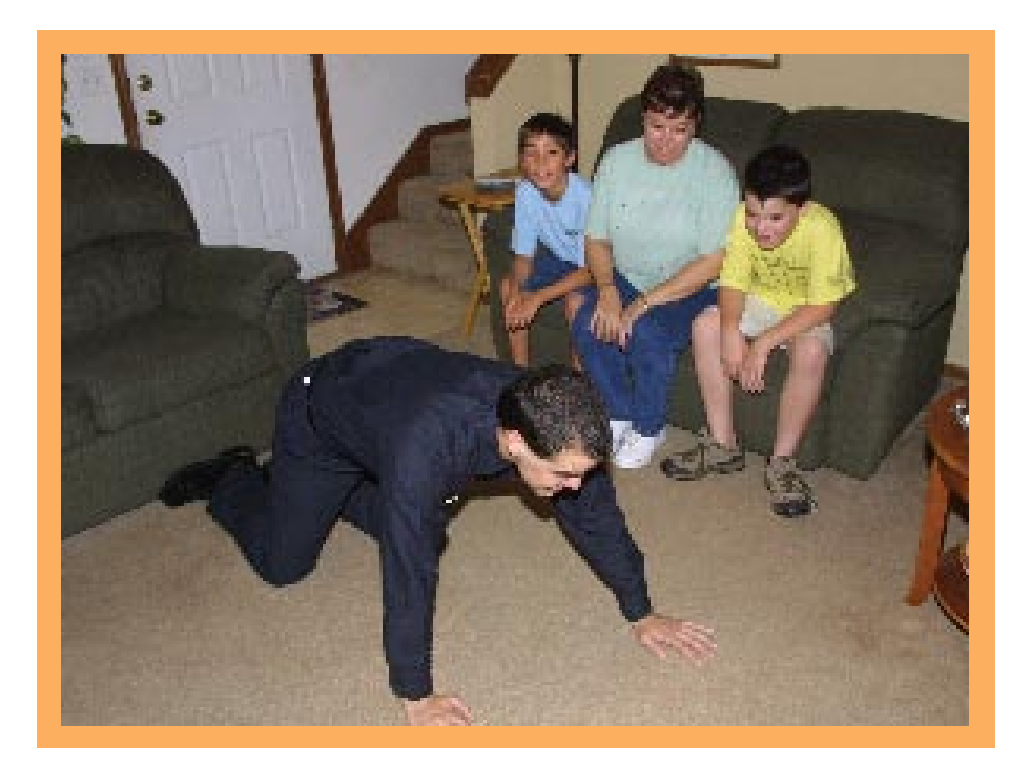
Figure 4: Practice crawling to get under smoke.

If you are trapped, call 911 or your local emergency number, and tell them where you are in your home.