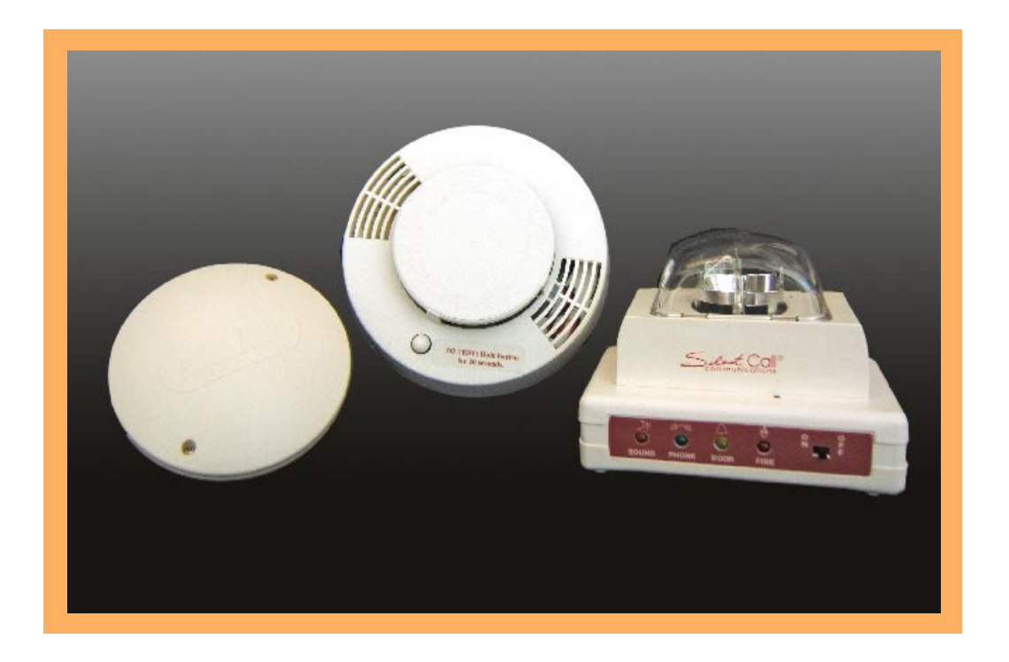
Figure 1: A smoke alarm for people who are deaf.

You need at least one smoke alarm outside every sleeping area and on every level of your home. The most dangerous fires occur when you are sleeping. The smoke alarm should detect the smoke before it reaches your sleeping area and wake you up.