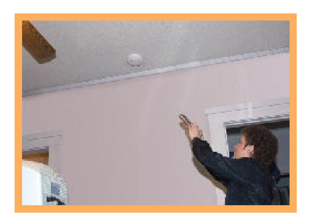
Figure 2: Point the remote toward the alarm.

To test the alarm, point the remote control at it. Hold down the volume or the channel button for 3 to 5 seconds (see Figure 2).