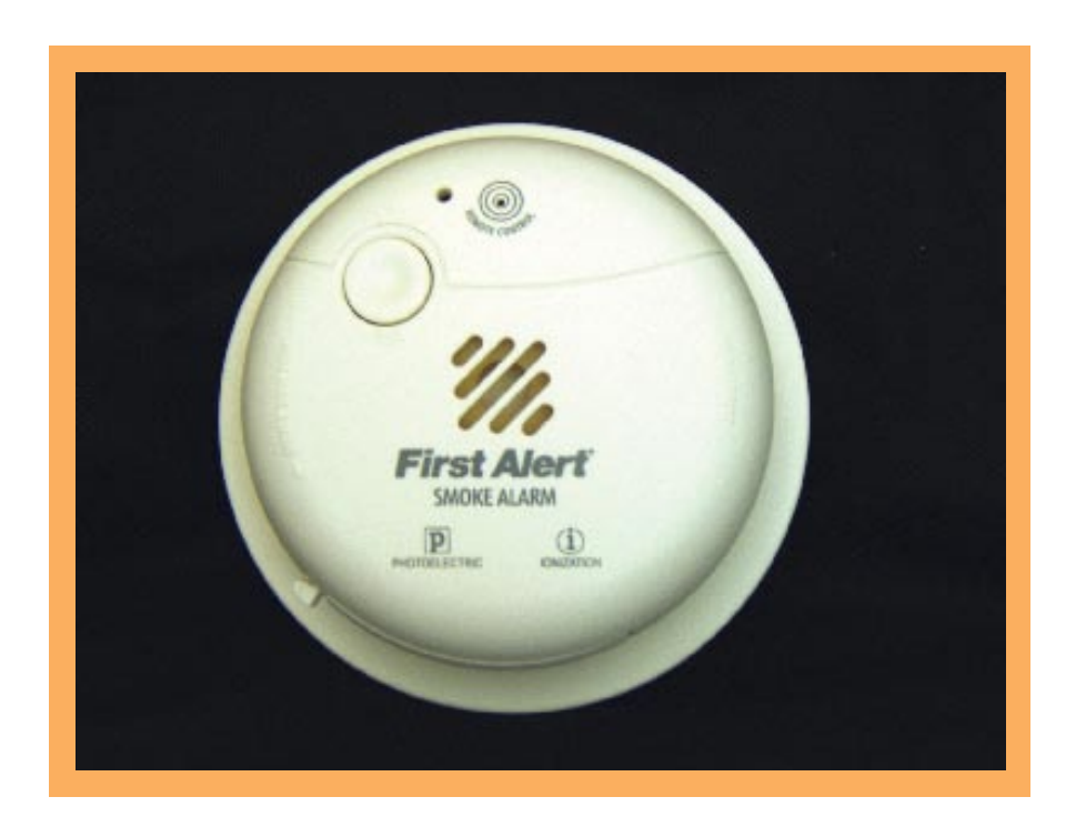
Figure 1: A smoke alarm for people who are blind or have low vision. This alarm comes with a 10-year battery and is tested and silenced by remote control.

You need at least one smoke alarm outside every sleeping area and on every level of your home. The most dangerous fires occur when you are sleeping. The smoke alarm should detect the smoke before it reaches your sleeping area and wake you up.