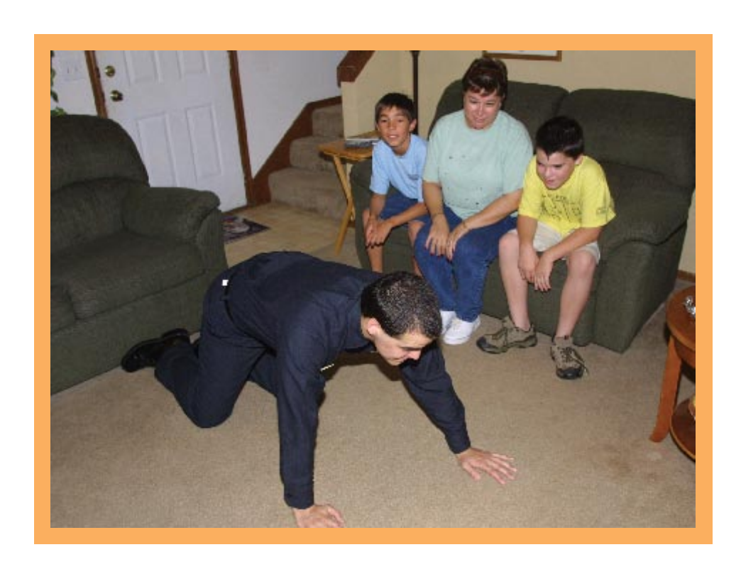
Figure 5: Practice crawling to get under smoke.

If you are trapped, call 911 or your local emergency number, and tell them where you are in your home.